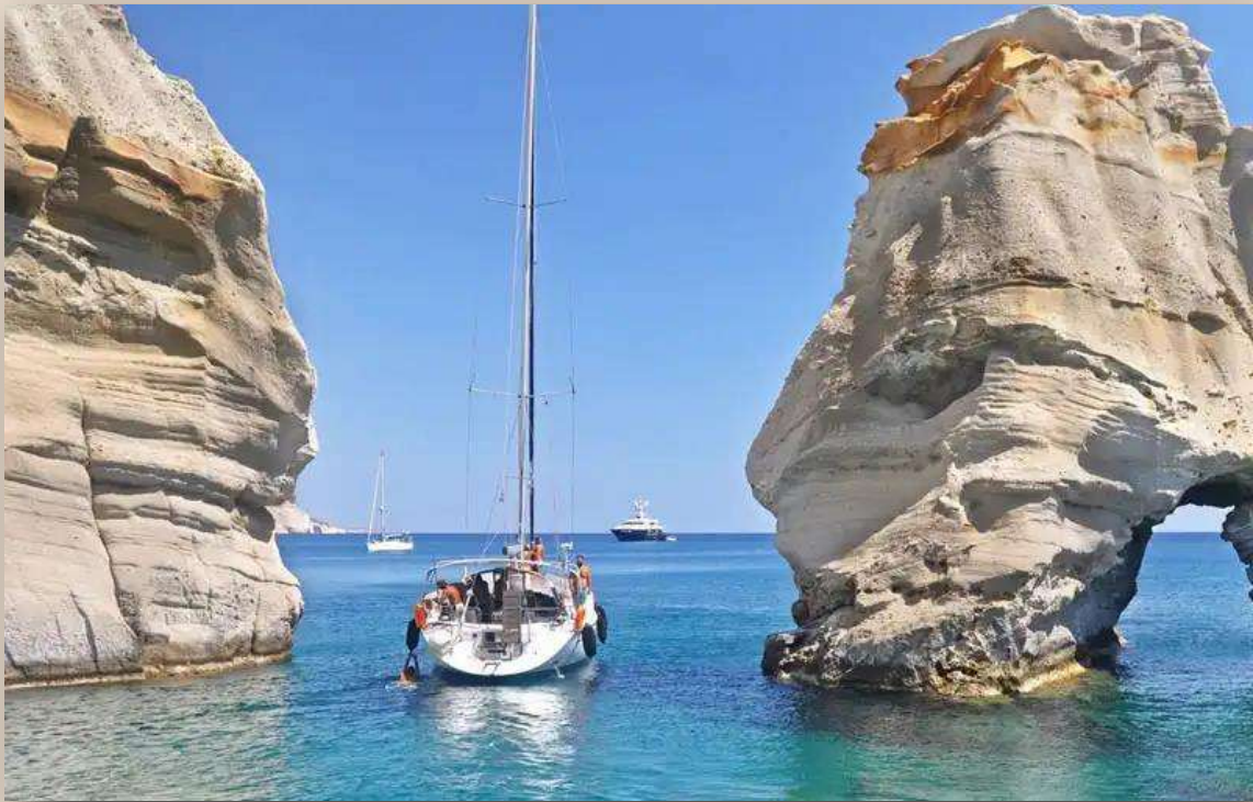
sailing boat in Kleftiko

On this full-day voyage, you have the choice between a majestic sailing boat or a luxurious catamaran. Whether you're seeking a serene day of relaxation or a lively excursion, the experience is tailored to your preferences. Feast on delectable food and refreshing drinks as you sail around Milos captivating coastline. Prices vary depending on your choice of vessel and the number of people in your group.