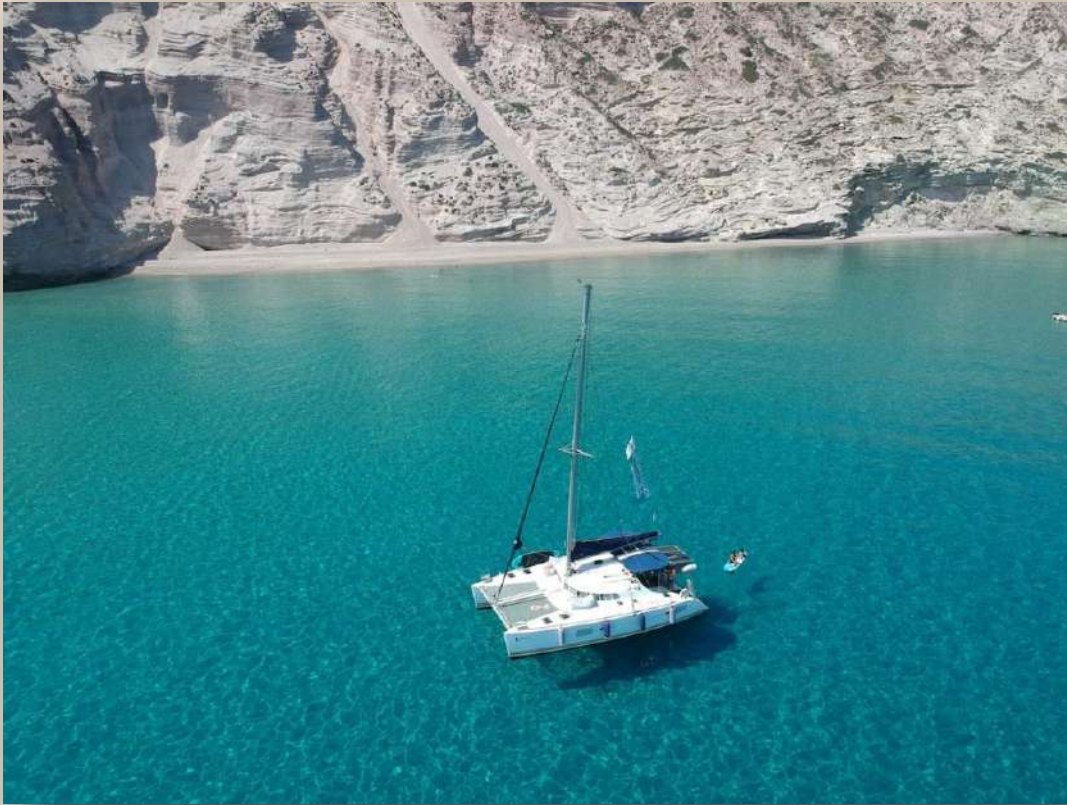
Catamaran in Polyaiagos